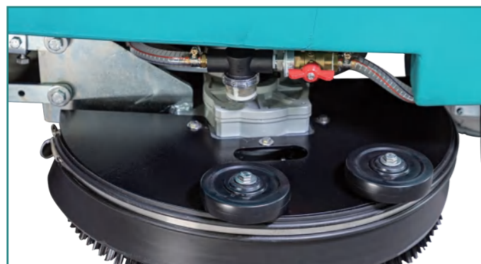
Floating brush head module automatically retracts when bumps against an obstacle in order to avoid collisions and damage