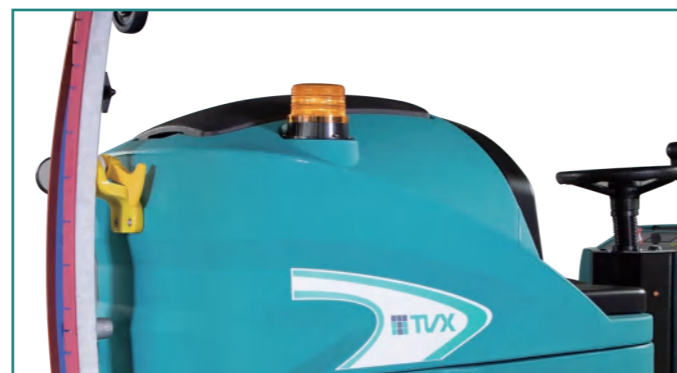
The fuselage comes with a head rack, which makes it easier to pass through narrow passages.