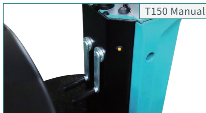
Squeegee/Brush lifting lever